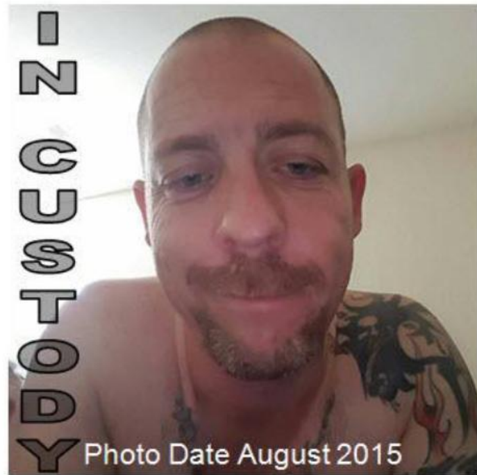
Photo Date August 2015